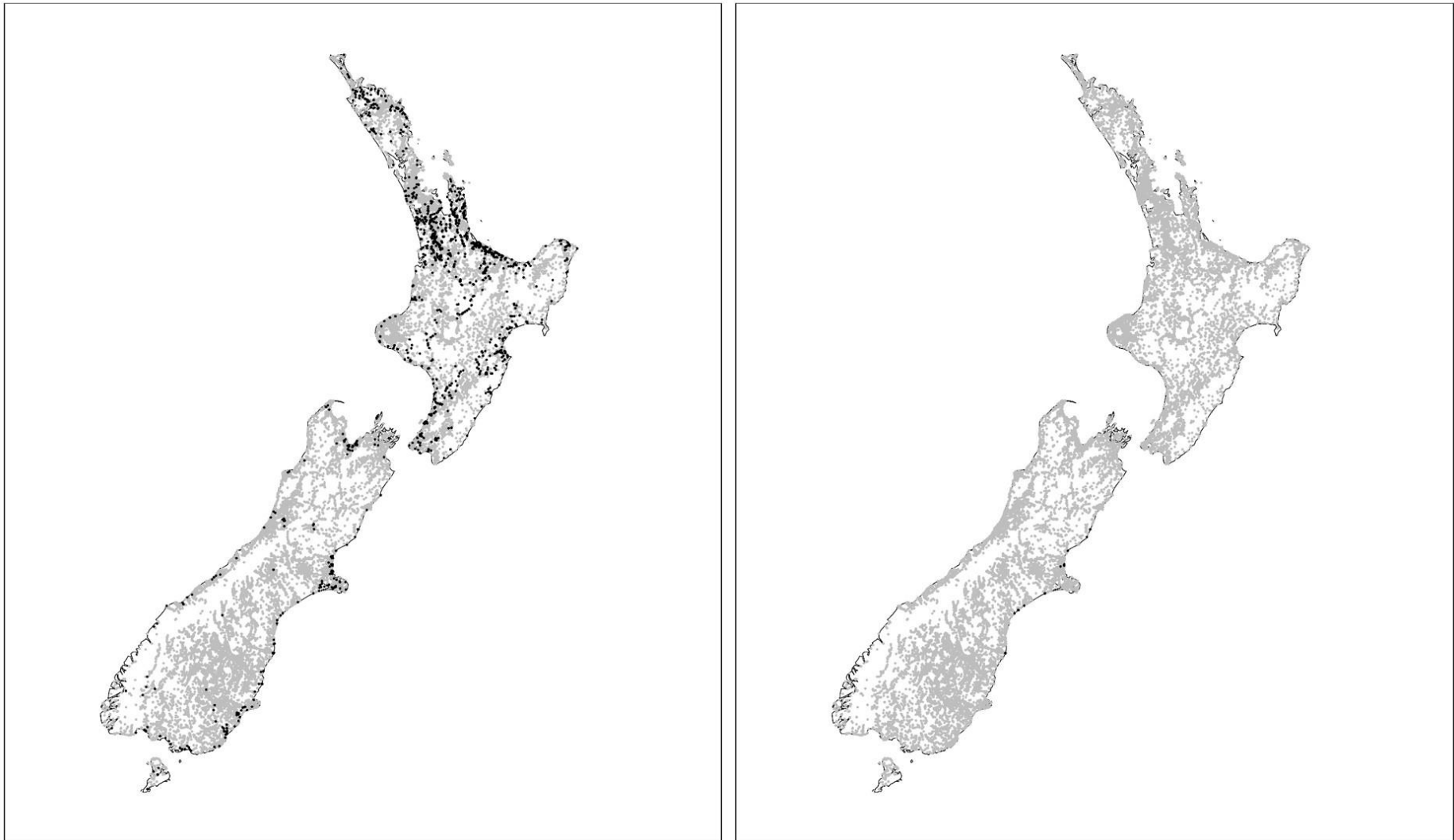
Figure 2: Locations of NZFFD records where (Left) common smelt, and (Right) Stokell's smelt are present (black circles) and absent (grey circles).