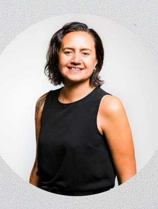
Whanganui, Ngāti Tūwharetoa, Ngā Rauru, Ngāti Apa, Ngāti Raukawa, Ngā Wairiki